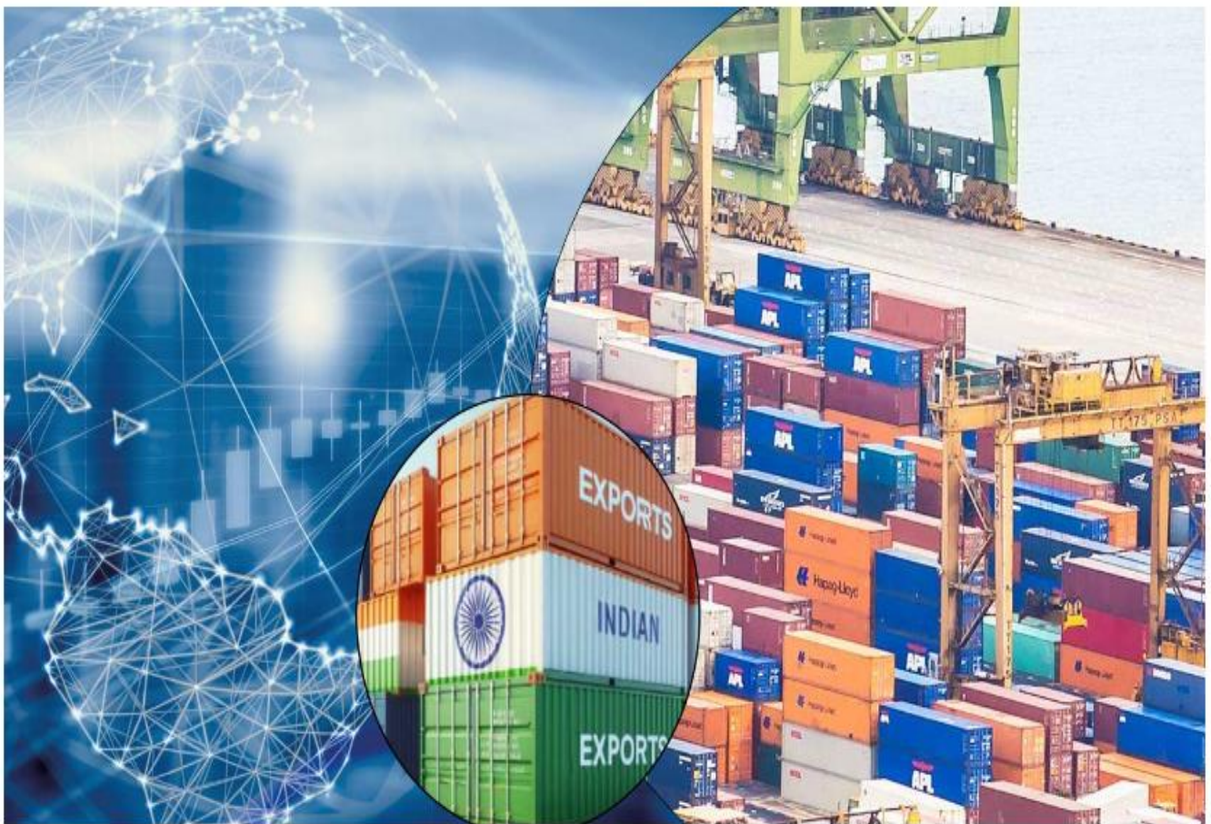
India Targets 4-5 pc Global Export Share With Diverse Product Portfolio